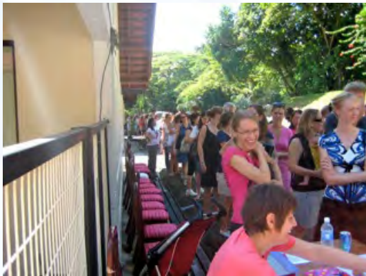
The crowd is waiting

If you have never been to one of our annual Garage Sales, here's how it works: